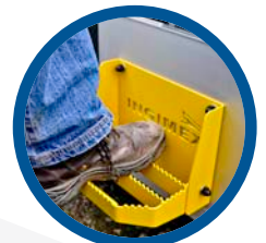
Ingimex folding footstep