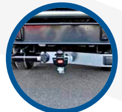
Ingimex tow bar installation

Tel: +44 (0)1952 585833 Email: sales@ingimex.com Website: www.ingimex.com