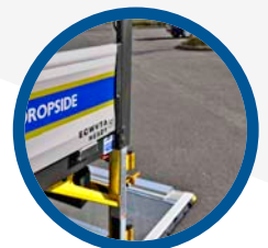
Ingimex tail-lift installation

Tel: +44 (0)1952 585833 Email: sales@ingimex.com Website: www.ingimex.com