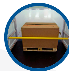
Ingimex load poles

Ingimex offers a range of bolt on options to increase the functionality of your box van.