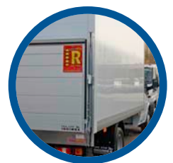
500kg tail-lift installation