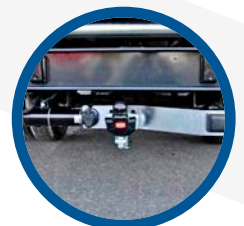
Ingimex tow bar installation

Tel: +44 (0)1952 585833 Email: sales@ingimex.com Website: www.ingimex.com