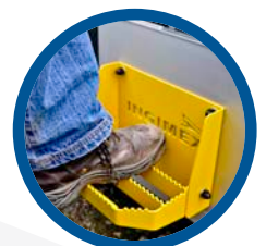
Ingimex folding footstep