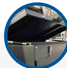
Ingimex tool trunk

We offer a number of bolt-on options for the Ingimex tipper such as additional load restraint points, lighting beacons, operator safety equipment and steel storage boxes.